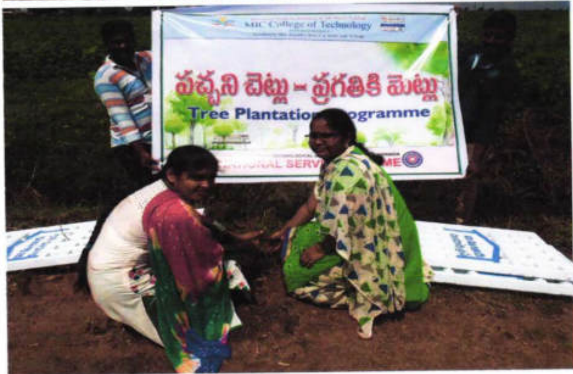
NSS Volunteers planting the saplings beside the main road of Perakallapadu