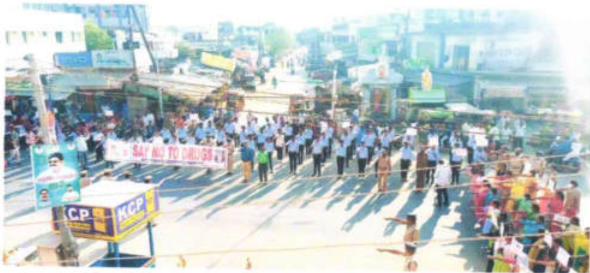
Pledging for SAY NO TO DRUGS by MIC Students

PRINCIPAL DVR & Dr. HS MIC College of Technology Kanchikacherla, N.T.R. Dt. Andhra Pradesh, India - Pin: 521180