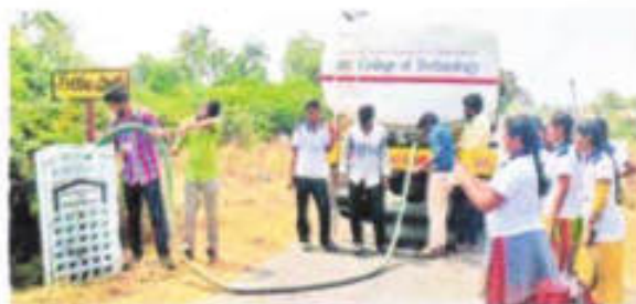
Watering of saplings by college water tanker