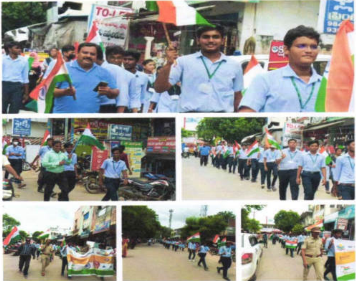
Jubilant participation by MIC Diploma students in TIRANGAWALK-HARGHARTIRANGA