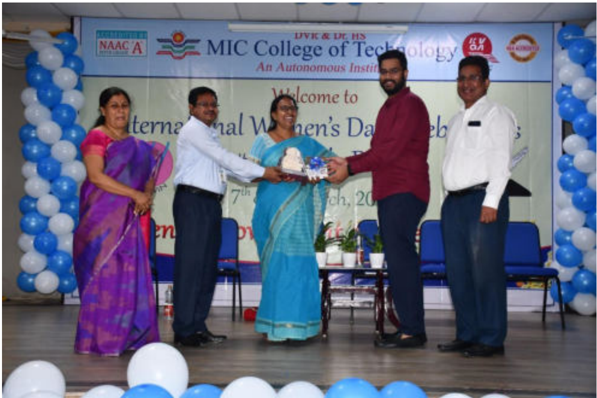
International Women's Day