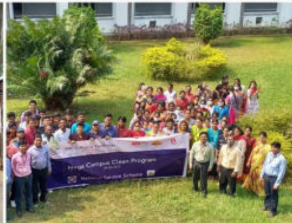
Mega Campus Clean Drive