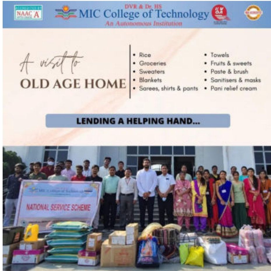
Visit to oldage home