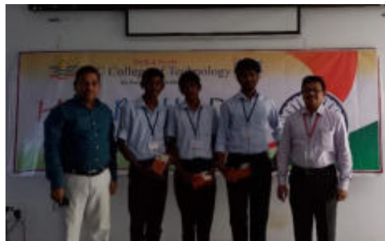
Republic day celebrations