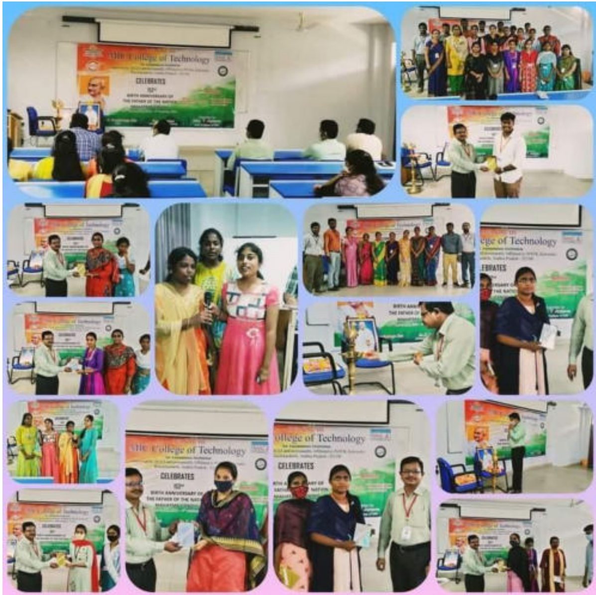
Gandhi Jayanthi Celebrations