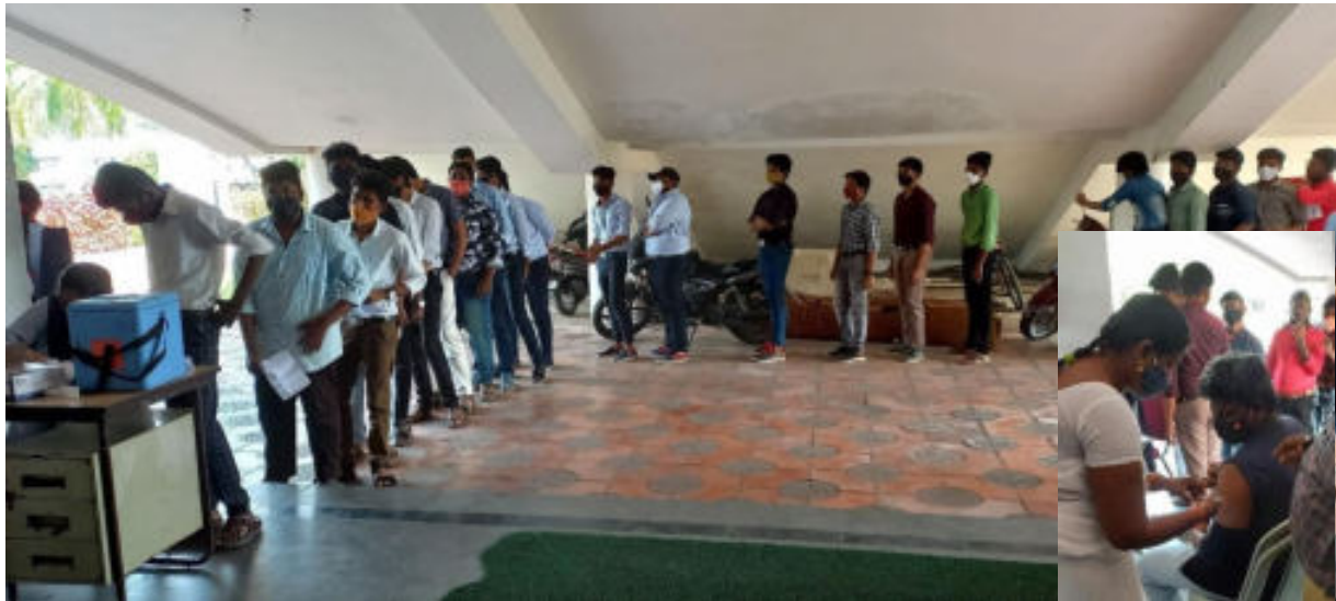
Mega Vaccination drive