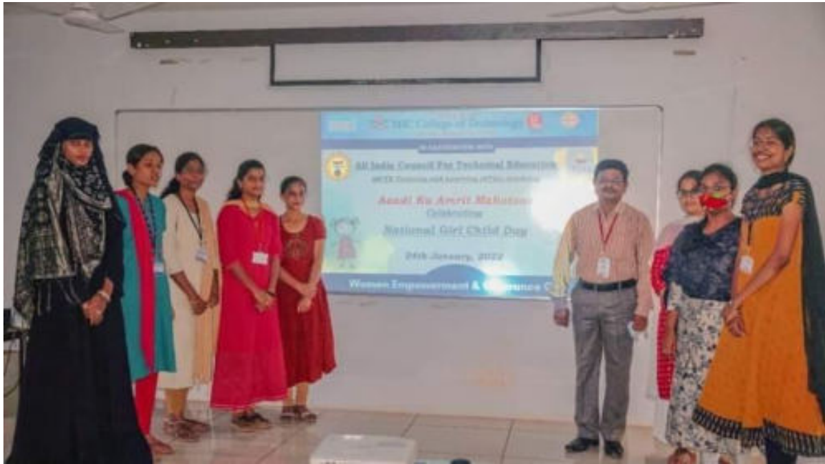
Girl child day celebrations