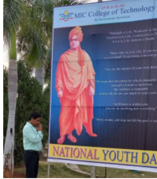
National Youth day celebrations