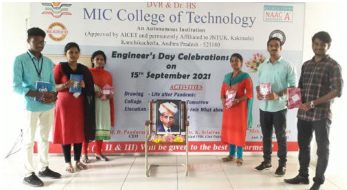
Participation in Engineers daycelebrations