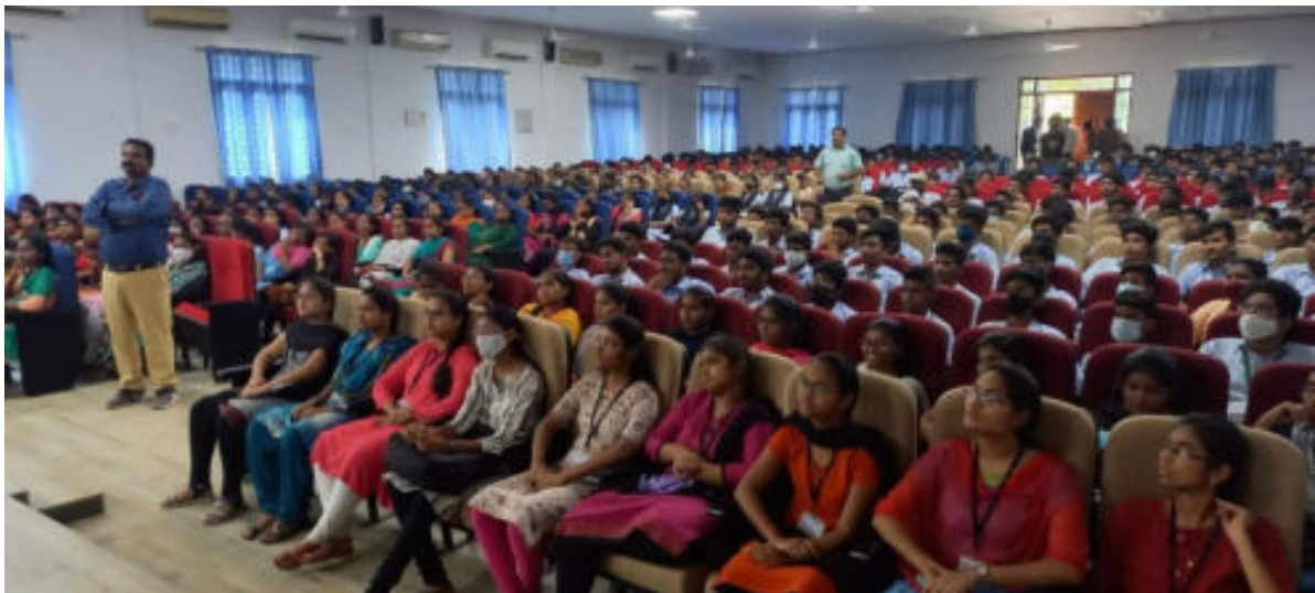
Awareness on various Cyber laws and acts