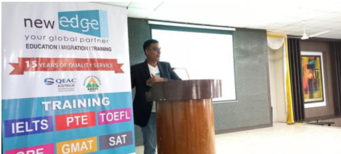
Career guidance program for NSSvolunteers