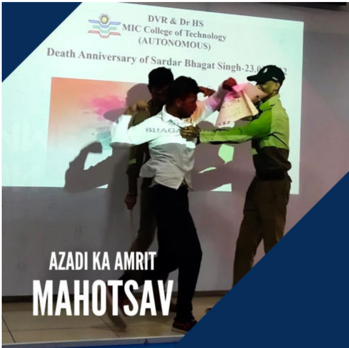
Sardar Bhagat Singh death anniversary